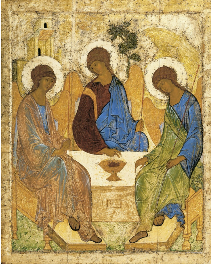
Andrei Rublev (c. 1360 - c. 1430), The Trinity , 1411.